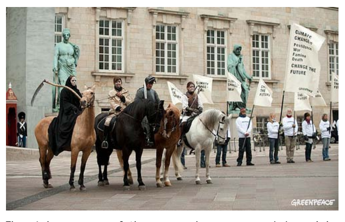
The 4 horsemen of the apocalypse, commissioned by Greenpeace, parade through the streets of Copenhagen

Back in Manchester, and wading through forty hours of footage, the task is now to compile, edit and produce a creative intervention in the ongoing climate debate. The finished product will draw on a diversity of voices: a Buddhist direct action group; a British MP; a 12-year old girl from the Amazon rainforest; Bangladeshi activists; a scientist from the Met Office—these are some of the highlights. It will also reflect the yawning gap between the two 'sides' in this common struggle: our intrepid crew had to move daily between riot police beating, tear-gassing and pepper-spraying peaceful protestors, and the crowds of frustrated, suited delegates that emerged from closed meetings inside the conference.