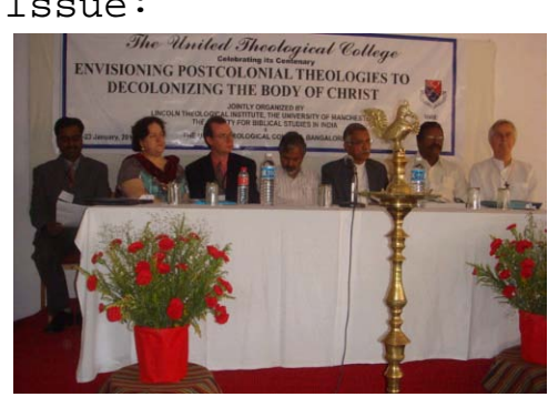
Bangalore Report Page 3