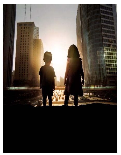
Cover image for S. Skrimshire (ed.), Future Ethics (Continuum Publishers, July 2010)