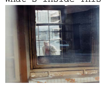
Belonging & Heimat Page 2